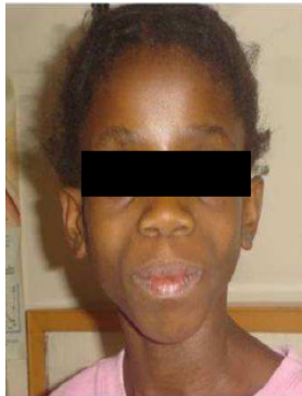
Figure 1: Example of lipodystrophy