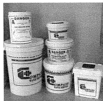
Example of single use containers